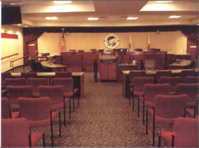
City Council Chambers